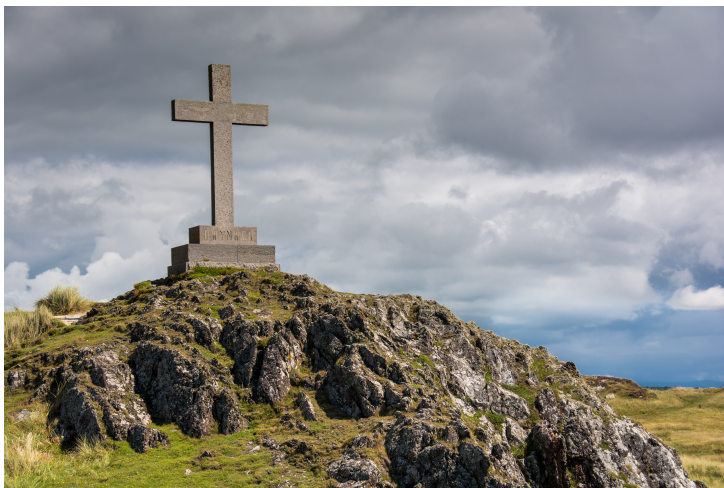
Cross of St Dwynwen

Anglesey has a number of famous saints, and while they were not canonized, the Church in Wales honoured them. One is Dwynwen, she was regarded as the saint of lovers, and she was a daughter of