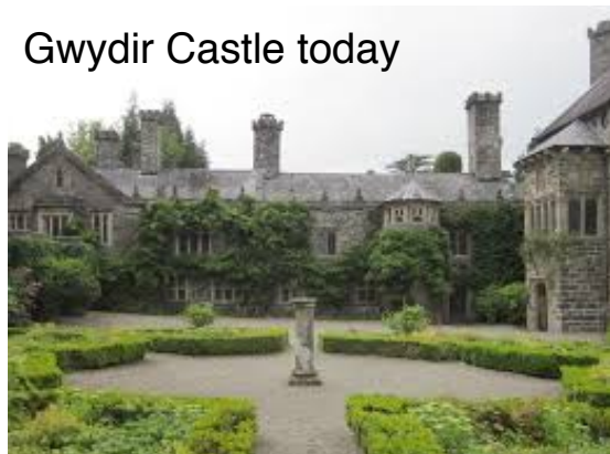
Gwydir Castle today

It has been bought from a private owner in the Wirral and the purchase has been made